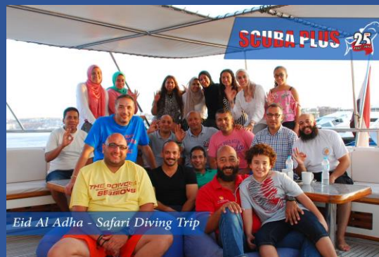
Eid Al Adha - Safari Diving Trip